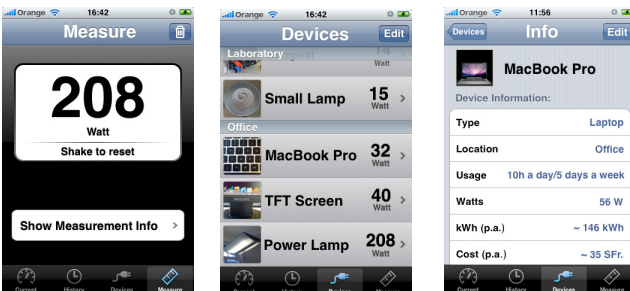
Figure 4. User interface measuring the consumption of a device

The prototypical deployment of our system concentrated on the technical aspects and the UI, future work will include a detailed evaluation of the prototype and the developed UI. Aspects to be evaluated include trials and a user study to find out what functionality and visualization users understand and prefer on such a mobile UI. In addition, we will investigate how such a solution performs in terms of energy savings in comparison to other feedback solutions available today. Our system enables the real-time