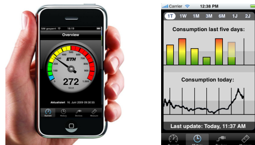
Figure 3. User interface accessing real-time metering data

The measurement screen (Fig. 4 left) allows interactive detection of the consumption or standby usage of a single or multiple ap-