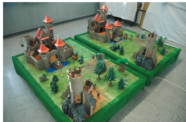
Figure 1. The two play sets, the KC (left) and the AKC (right), respectively

The Augmented Knights' Castle (AKC) is a digitally augmented play environment designed to enable various forms of context-sensitive audio feedback to take place seamlessly while playing with the characters and scenery in the play set. The audio feedback was tailored to be suitable for a Middle Ages context for children, to enhance their play and storytelling and to foster playful learning of medieval facts and stories.