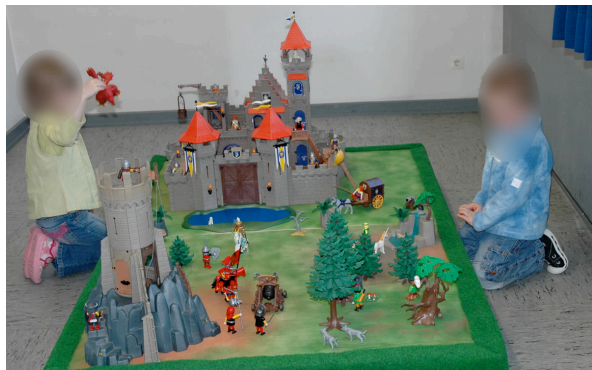
Figure 3. Children playing with the play set.

If children had another 20 minutes to play with either set, which one would they choose? 27 out of 37 (73%) chose the AKC, significantly more than choice of the KC, \chi^2 (1) = 7.8 , p < .005 . Furthermore, 36 out of 37 (97%) liked having background music that fits the medieval scenario.