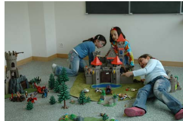
Figure 1: Children playing with the Augmented Knights Castle.

Augmented toys and smart toys are traditional toys or game pieces that are equipped with sensing technology, computing power, and communication capabilities, allowing designers to incorporate novel gaming elements previously available only in video games into traditional “real world” objects [5, 6]. They attempt to retain the benefits of computer-supported interaction without diminishing the social aspect: children play together by sharing the playset and their stories, which consequently defines an augmented toy environment as a (set of) “shareable” tangible user interfaces, which allow and encourage simultaneous and co-present interaction (see Fig. 1) [4].