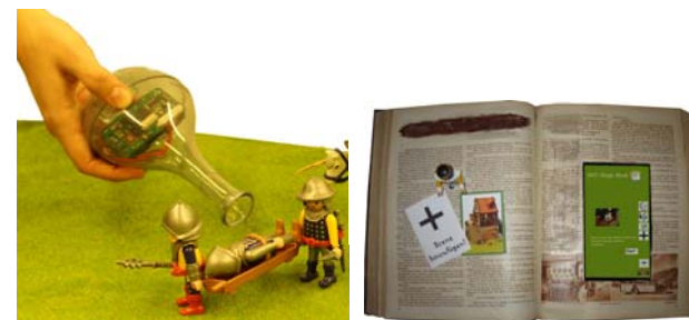
Figure 2: The magic potion is administered to wounded soldier during the play (left), and the magic book used for displaying information and configuring the playset and scenarios (right).

Currently, we are conducting a user study to evaluate the benefits and acceptance of this shareable pervasive computing environment. By attending this workshop, we hope to receive valuable feedback through discussions and comments, as well as meeting researchers working on similar topics and projects.