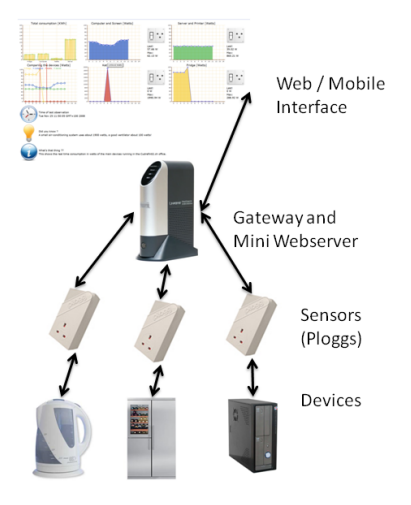
Fig. 1. Devices extended with Ploggs communicate with a gateway to offering the Ploggs functionalities through a RESTful API.

The architecture of our prototype is based on four main layers as shown on Figure 1. The first layer is composed of appliances we want to monitor and control with the system. In the second layer, each of these devices is then plugged to a Plogg sensor node. In the third, these nodes are discovered and managed by a gateway software which can be installed on any computer or embedded device with sufficient memory and Bluetooth communication capabilities. The gateway also embeds a micro webserver which offers the monitoring and control functionalities of the Ploggs as structured URLs. Finally, the last layer is the visualization interface. It uses the web-accessible functionality to dynamically draw graphs depicting the current energy consumption of all the Ploggs available in the environment.