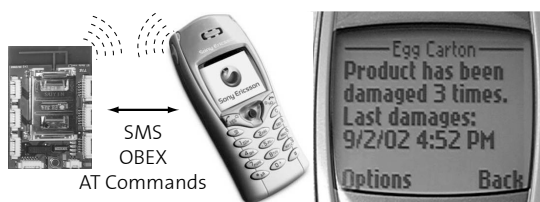
Figure 3. Product monitoring using BTnodes as smart tags and SMS via mobile phones

Many applications have been realized using the BTnodes. Most of them are ubiquitous-sensing and monitoring applications where fast prototyping and ease of deployment are a key concerns [2, 10]. Other applications such as the one shown in Fig. 3 want to interface networks of sensors to commercial devices such as cell phones [12, 13] and PDAs [7]. For the latter type of application, compatibility and adaptability of the interfaces is the most critical issue.