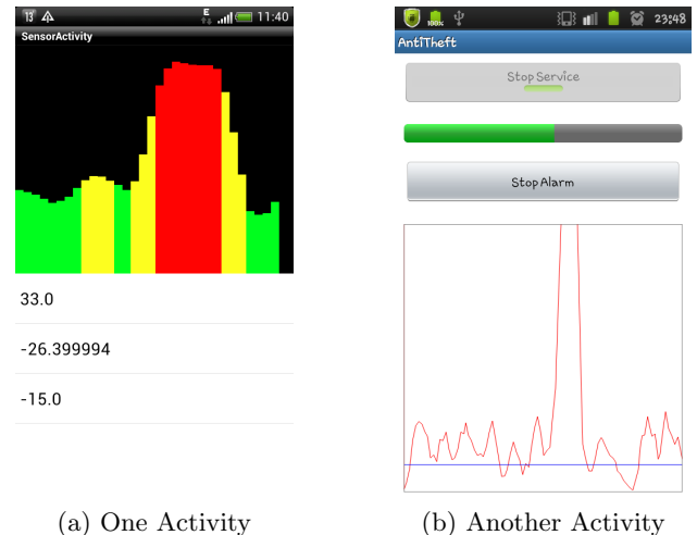
Figure 1: Pack portrait screenshot next to each other and make them referable through the subfigure package. When next to each other, make them the same height.