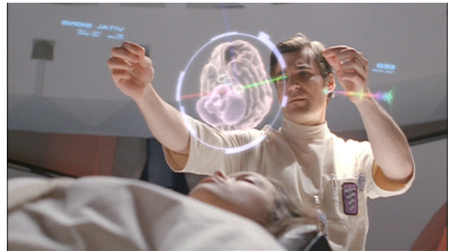
Figure 1: Reality is augmented with a virtual object [7].

Like other smart devices, smart glasses will often also have a camera. Significant differences to other camera devices are