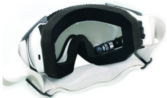
Figure 5: Reckon MOD [11]