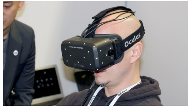
Figure 7: Oculus Rift Crystal cove prototype [13]

The Oculus Rift is a virtual reality solution which uses two displays placed in front of lenses close to the eyes of the wearer. There is one display in front of each eye, together they have a 1920x1080 pixel resolution on the newer proto-