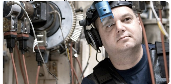
Figure 4: Brückner TRAVIS [10]