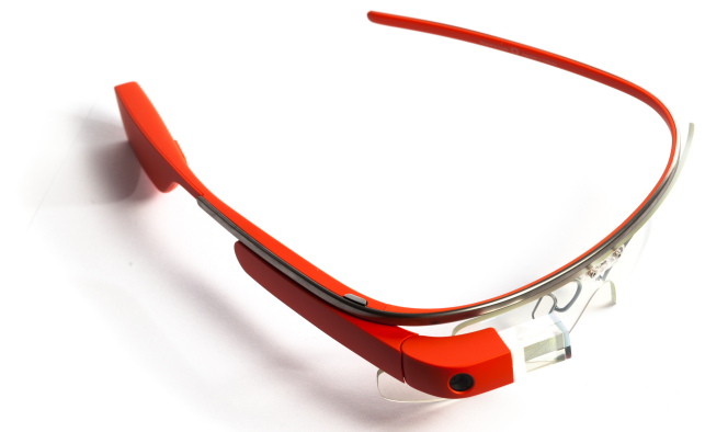
Figure 2: Google Glass developer version [8]

Both systems with two displays presented in this section need to be connected to a PC with a cable by which the virtual ob-