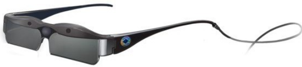
Figure 6: Cast AR [12]

jects are created. In the future similar devices could be wireless and worn outside. Those devices are interesting because they do not focus on displaying information but rather try to create an exciting visual experience.