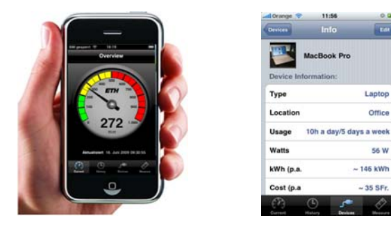
figure 1. User interface accessing real-time metering data

The backend architecture of our prototype is based on three independent elements (fig. 2). The first monitors and logs the energy consumption by the sensors of the smart meter. The second element, the gateway, consists of a parser, a database, and a tiny web server. To acquire the logged data from the Landis + Gyr smart meter E750 on a continuous basis in real time, the Smart Message Language (SML) [3] parser automatically polls the meter's