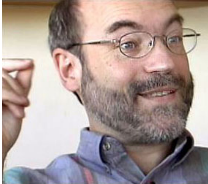
Figure 1: Mark Weiser (1952–1999), the visionary behind ubiquitous computing