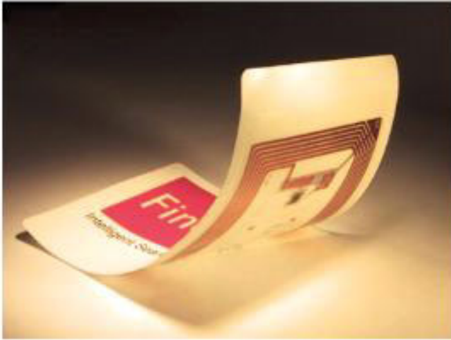
Figure 3: A “Smart Label” (ETH Zürich)

ronment, including what we do and say [Mattern/Langheinrich 01].