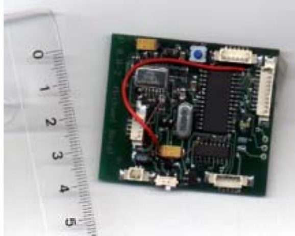
Figure 2. Prototype implementation of the Smart-Its device for validation of the Friends technique (scale in centimeters)