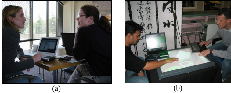
Fig. 1. (a) Collaboration at an airport (reproduced from [4]) (b) Collaboration around an UbiTable

The goal of the UbiTable project is to provide efficient walk-up setup and fluid UI interaction support on horizontal surfaces. We wish to enable spontaneous, unplanned, collaboration where the participants share contents from their mobile devices such as laptops and PDAs. We draw technological underpinnings from peer-to-peer systems [4], ad hoc network protocols (such as 802.11 ad hoc mode, or Bluetooth), and existing authentication and encryption methods. Our focus is on design solutions for the key issues of (1) a model of association and interaction between the mobile device, e.g., the laptop and the tabletop, and (2) the provision of three specific shades of sharing semantics termed Private , Personal and Public . This is a departure from most multi-user systems where privacy is equated with invisibility. Figure 1 (b) shows the current UbiTable setup. Note that UbiTable also provides a variety of digital document manipulation functions, including document duplication, markup, editing, digital ink for drawing and annotation. The elaboration of these functionalities is out of the scope of this paper.