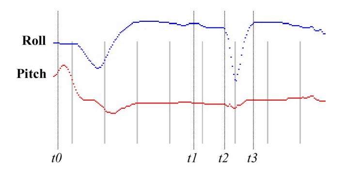
Figure 4: Acceleration versus time for each axis of motion is plotted here. Each signal is labeled and shown independently, with the acceleration value on the vertical axis and time on the horizontal axis. The vertical gray bars are at one-second intervals, and dotted vertical lines denote points of interest.

scrolling continues on both axes, so the application may scroll from one item to the next in a menu and the gesture's action is applied to the wrong object. This can be seen in Figure 2, where in the fourth frame, the thumbnail menu is scrolling because the gesture has not yet been recognized. To correctly associate the gesture with the right device state, the scrolling code is speculatively executed by saving the time and current scrolling state before each change occurs. When the system recognizes a gesture at t3, the system restores itself to the state at t2 (shown in the first frame of Figure 2), then applies the gesture's operation. The scrolling state need not be saved indefinitely, since a maximum length of a gesture can be defined.