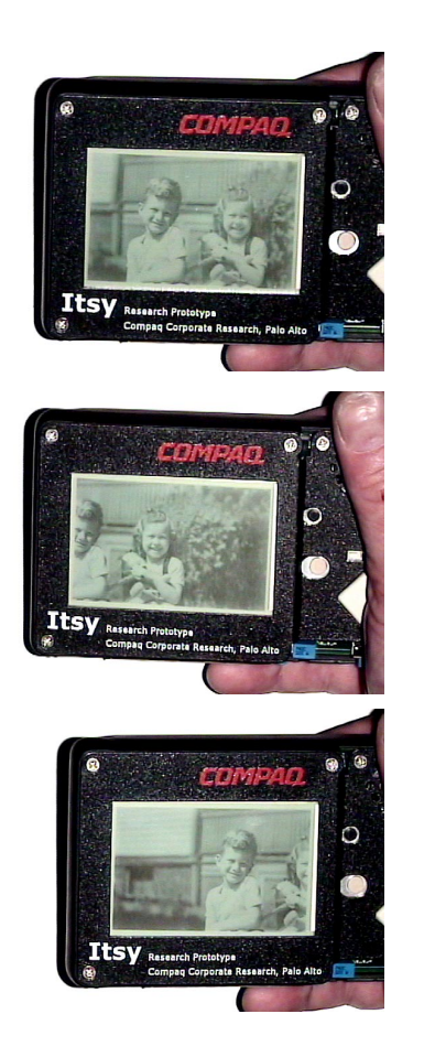
Figure 5: In the frame at the top, the picture is in the initial position. When the left edge of the device is dipped, seven of the fifteen subjects expected gravity to "slosh" the picture into the position it has in the center frame, and five of the fifteen subjects expected to see the picture like the bottom frame because they "pointed" with the left edge of the device to that corner of the picture.