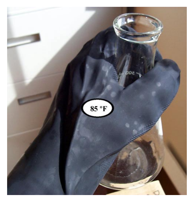
Figure 8: Industrial glove with hands-free thermometer (mock-up).

In the discussion to this point, users always held the device in either or both hands. However, since all interaction occurs by manipulating the device, it could also be worn. One promising area for wearing a small gesturecontrolled device is on the "snuff box "portion of either hand - that is, the area between the thumb and index finger on the back of the hand. This area is typically visible when using your hands. Gestures can be made on either of the device's axes by moving either your hand or forearm. Figure 8 shows how a thermometer that measures the temperature at the palm of the glove could be mounted. By gesturing, the user can change the display to show the minimum, maximum, or current temperature. Other gestures could be used to switch the scale between Fahrenheit and centigrade and clear the saved minimum and maximum values. While at first this might seem a contrived example, consider for a moment the difficulty of trying to push your watch's buttons while you have gloves on.