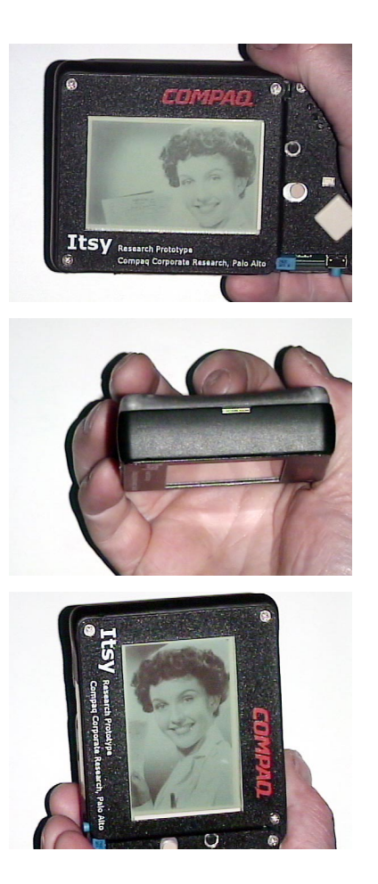
Figure 3: As shown in this sequence, the user positions the album in the desired orientation, then holds it for a couple of seconds to change the display from landscape to portrait mode.

With these design constraints in mind we chose a twoaxis, single-chip accelerometer - Analog Devices'