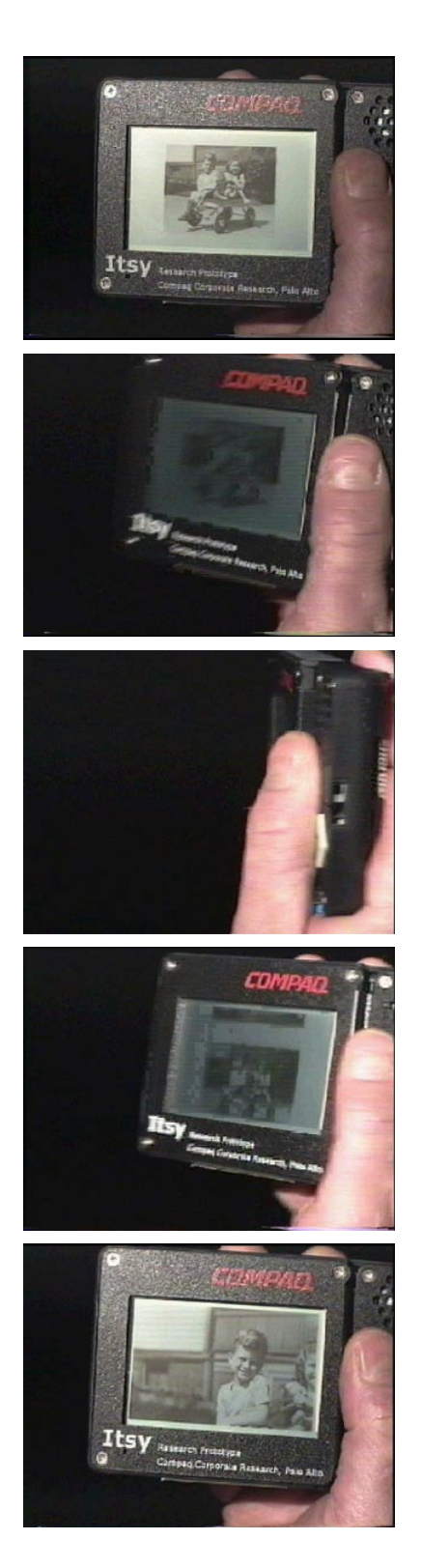
Figure 2: The first frame of the sequence (top-to-bottom) shows the thumbnail photo. In the next three frames, the user fans the device. The fifth frame displays the full-size picture.

Other possible command gestures include snapping or shaking the device, tapping on it with the other hand, or fanning it. Unlike Levin and Yarin's implementation[7], we rejected snapping and shaking the device because of the strain it places on the user's hand and wrist. The mass of a 4-to 6-ounce device proves sufficient to strain users when they repeatedly perform such a gesture. Tapping is attractive because it doesn't require users to move the device, but