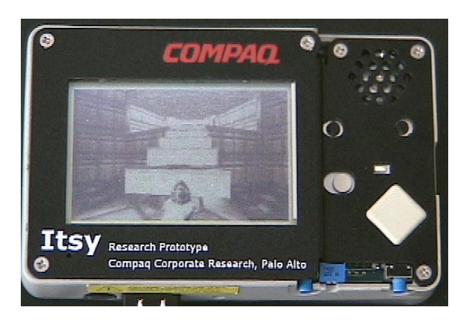
Figure 7: Doom on Itsy

We also observed this behavior with the game Doom that we ported to Itsy. In Figure 7, virtually all users expected that when they tilted the top edge of the display