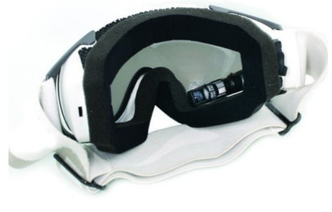
Figure 5: Reckon MOD [11]