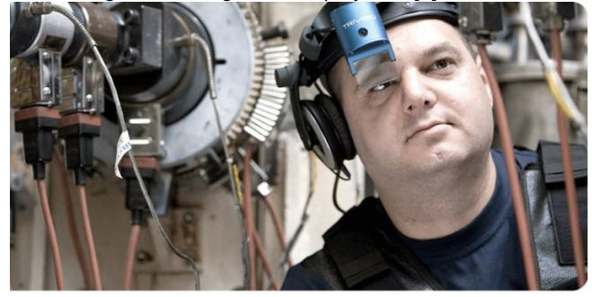
Figure 4: Brückner TRAVIS [10]

Figure 3: Google Glass display: A mini projector projects onto a semi reflective mirror which only affects light stemming from the projector [9].